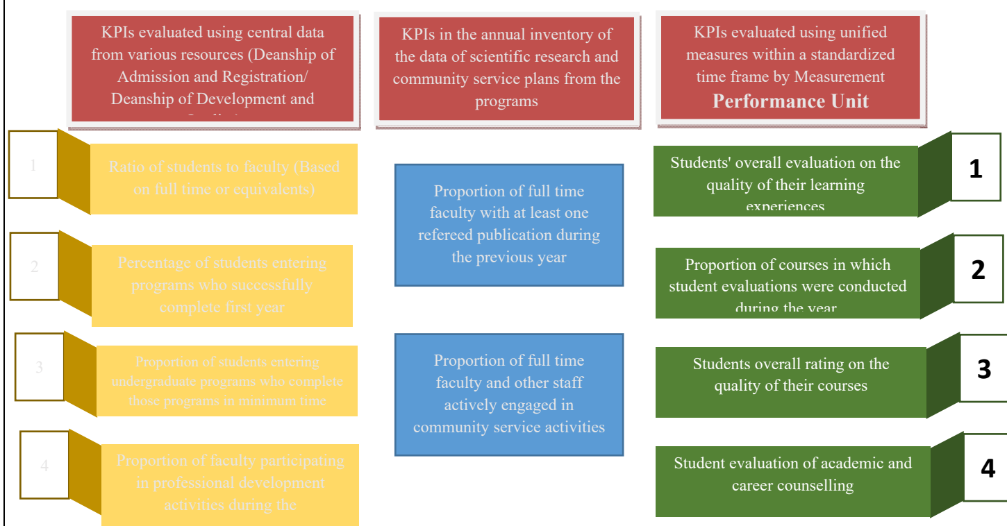
Figure (2): Distribution of KPIs according to the methods of evaluation and data collection

The programs conducted internal benchmarking with corresponding programs from the university or approximate specialization and area of knowledge, as shown in the tables of KPIs evaluation and result discussion. If the results of corresponding programs are unavailable, the previous evaluation is adopted.